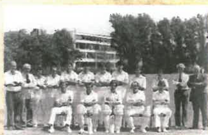
Newport reach the last 16 of the National K.O, losing to Keynsham (A).