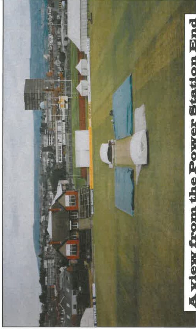
A view from the Power Station End