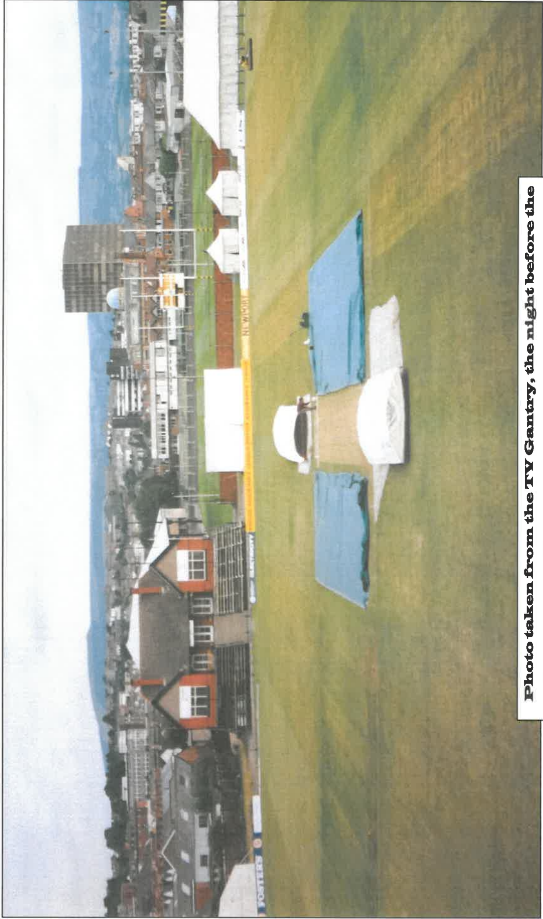
Photo taken from the TV Gantry, the night before the Glamorgan v Yorkshire match (24th June, 1990)