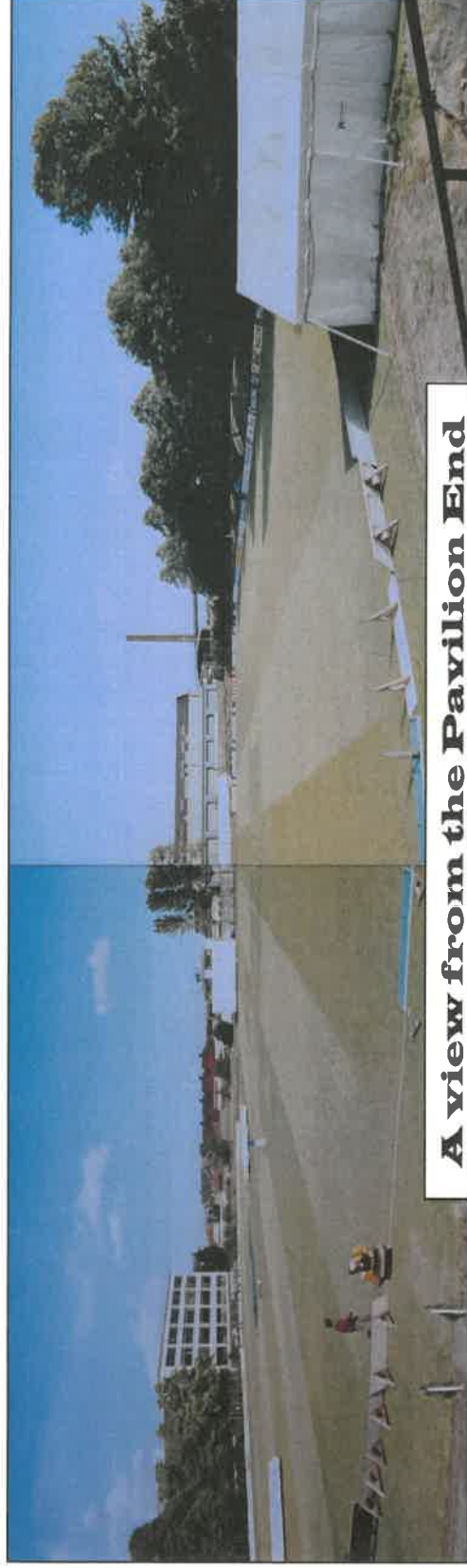
A view from the Pavilion End