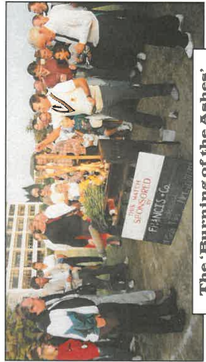
The 'Burning of the Ashes'