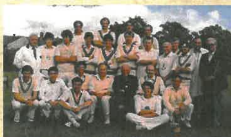
150th Year Anniversary, with six of the Club's Glamorgan players involved in a Captain's v Chairman's match.