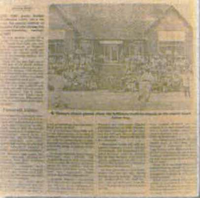
Rodney Parade is sold for a new Maindee Primary School (May 1988).