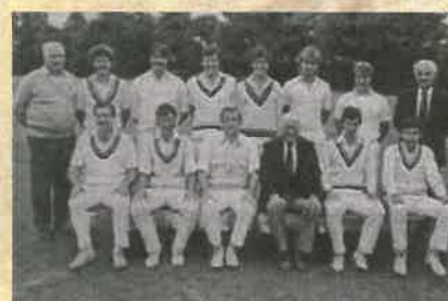
WESTERN LEAGUE RUNNERS UP As the 'Battle To Save Rodney Parade' raged, the Rugby dominated Athletic Club made its intentions to sell the Cricket ground very clear.