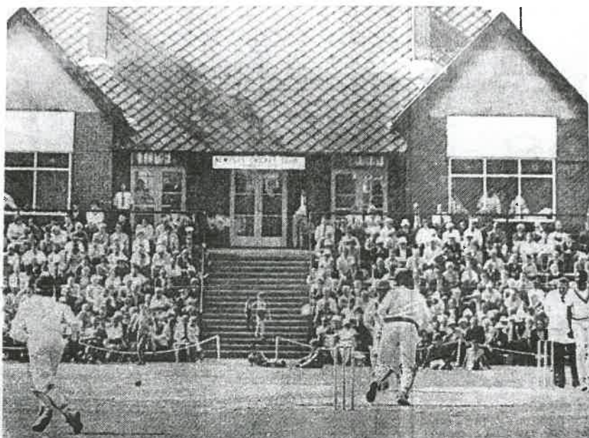
● Newport cricket ground, where the bulldozers could be digging up the cricket square before long.

The Historic Rodney Parade Cricket Ground is Sold for the replacement Maindee Primary School in 1988