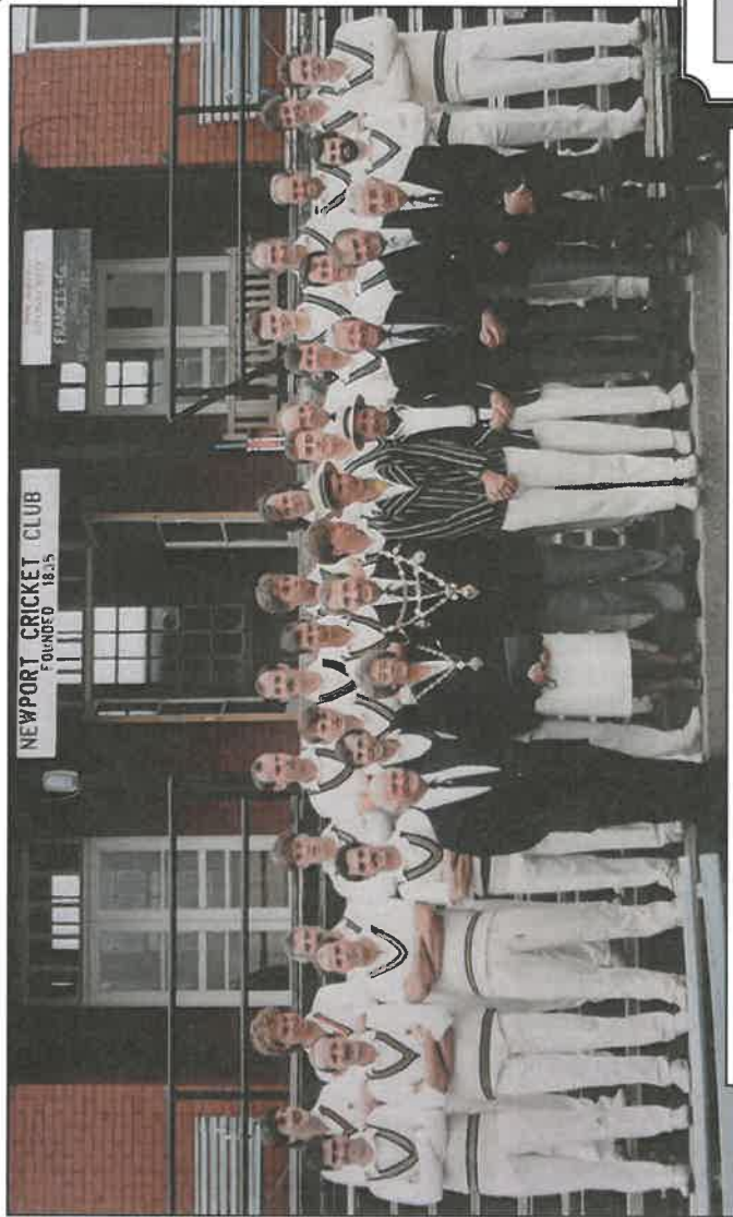
The Newport and Cardiff Teams