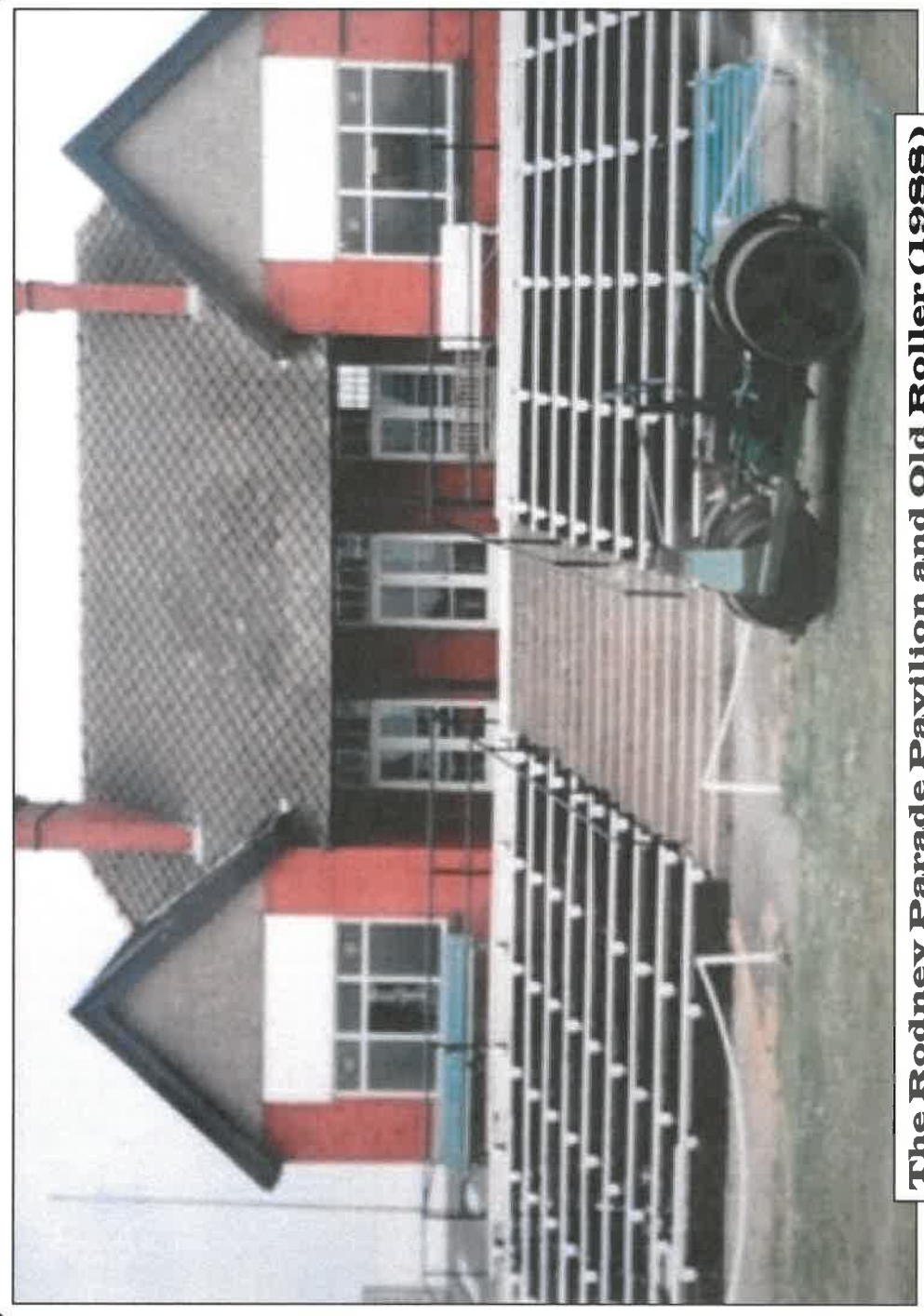
The Rodney Parade Pavilion and Old Roller (1988)

The historic Rodney Parade Cricket ground, first donated by Lord Tredegar in 1892, had survived two World Wars in its 97 years existence. The ground had staged First Class Cricket since 1935, but had now been lost ..... to fund the onset of Professional Rugby!